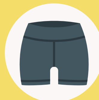
Short Tights or other Clothing Above Mid Thigh