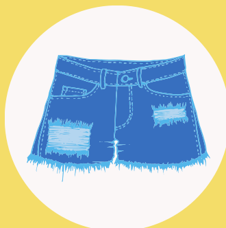
Rips Above Mid Thigh