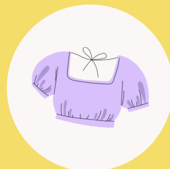
Crop Tops/Midriff Shirts