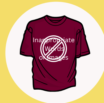
Clothing with Inappropriate Words or Images