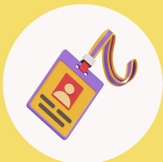
Not wearing a current school issued ID.

Students have a right to wear stylish clothes of their choice as long as those clothes are appropriate for school, are not dangerous to health and safety, and do not create a substantial and material disruption of the school. Other attire may be allowed for special school activities with approval of the school administration. Changes to clothing trends will not override the dress code policy.