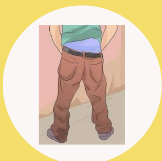
Clothing not Properly Secured at the Waist